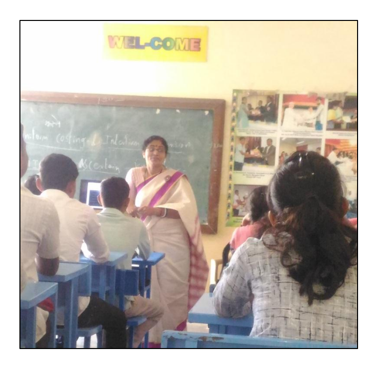
'Competitive Exam Workshop'