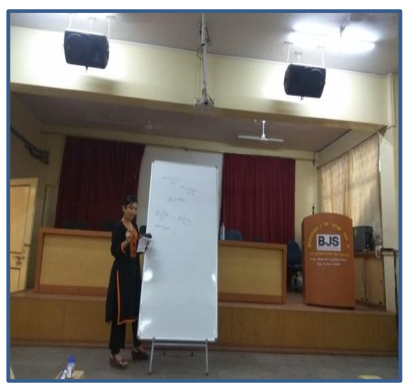
Banking Course 'Sonam Metheghar'