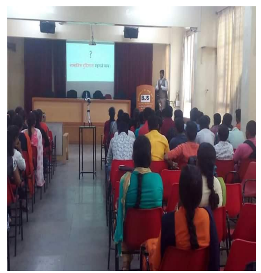
'Social Intelligence Workshop'