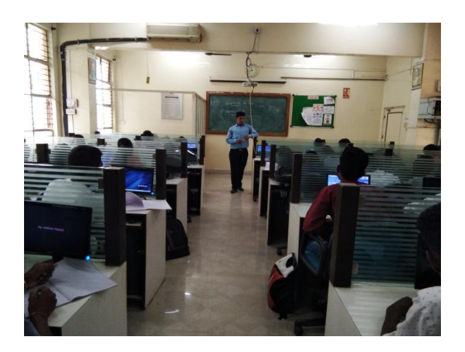
Tally ERP 9 Course