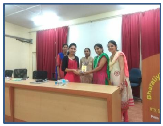
Commerce staff with guest.