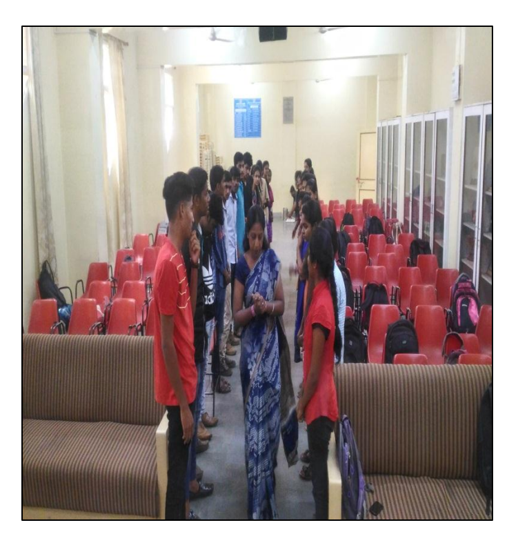
Activity 'Competitive Exam Workshop'